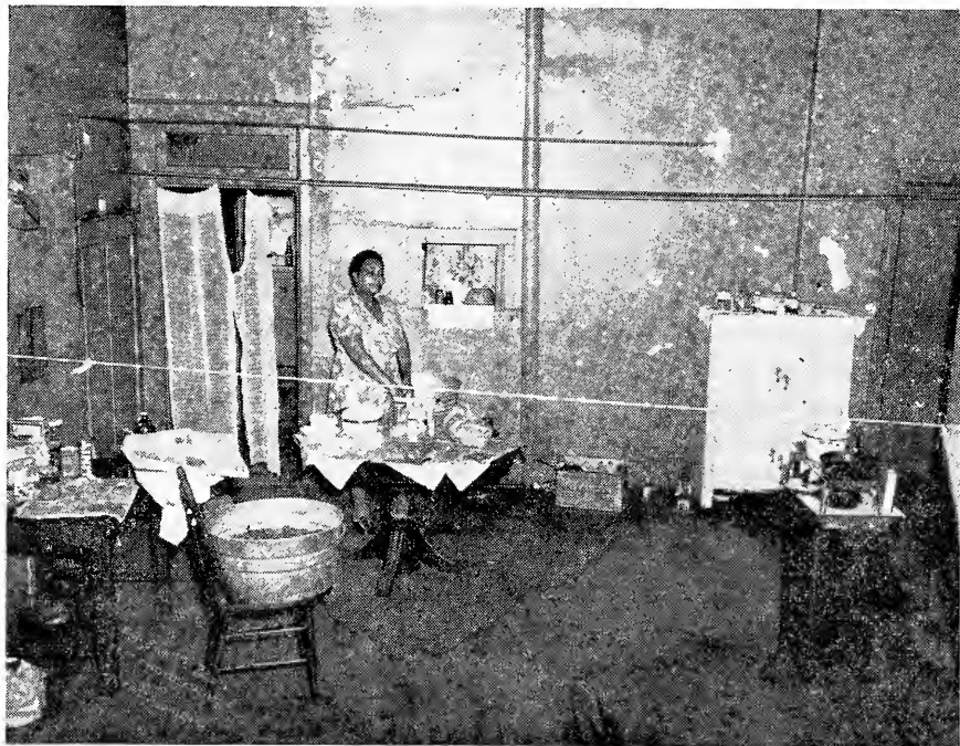
This Detroit mother pays a monthly rental of $50 for these storefront living quarters. The following three pictures are of the same "home", typical of war crowded Detroit in 1943.